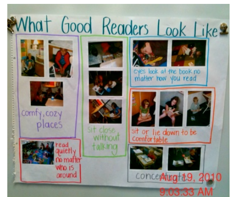
Above: Evolution of Anchor Charts